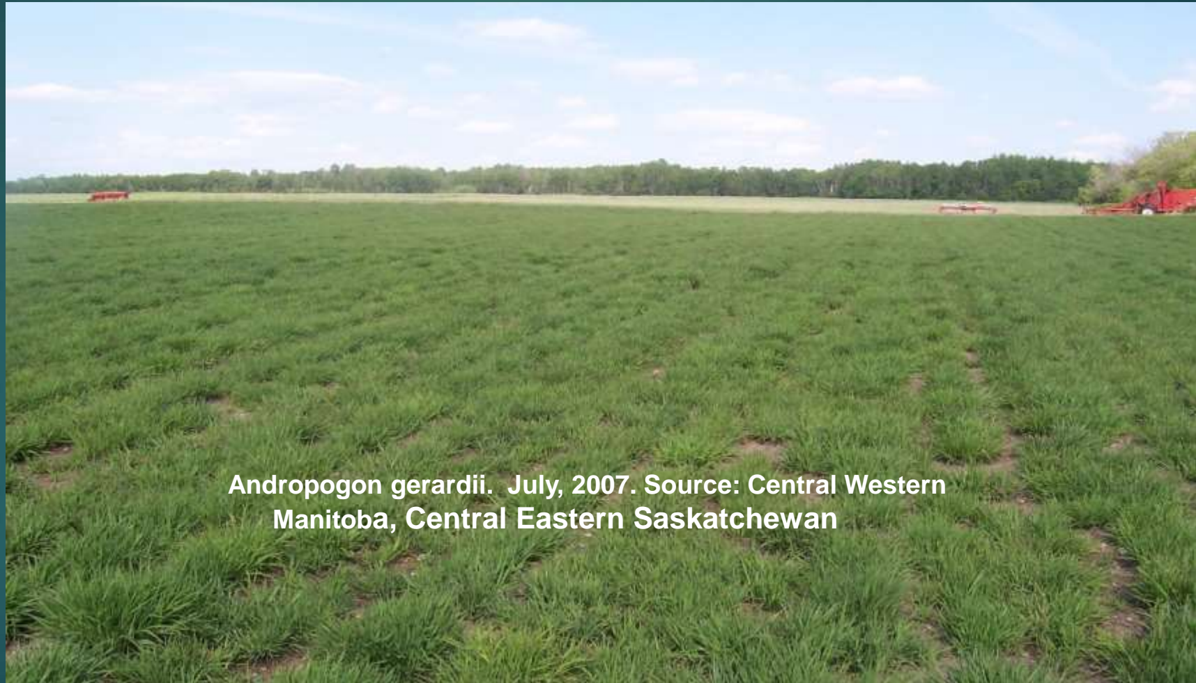
Andropogon gerardii. July, 2007. Source: Central Western Manitoba, Central Eastern Saskatchewan